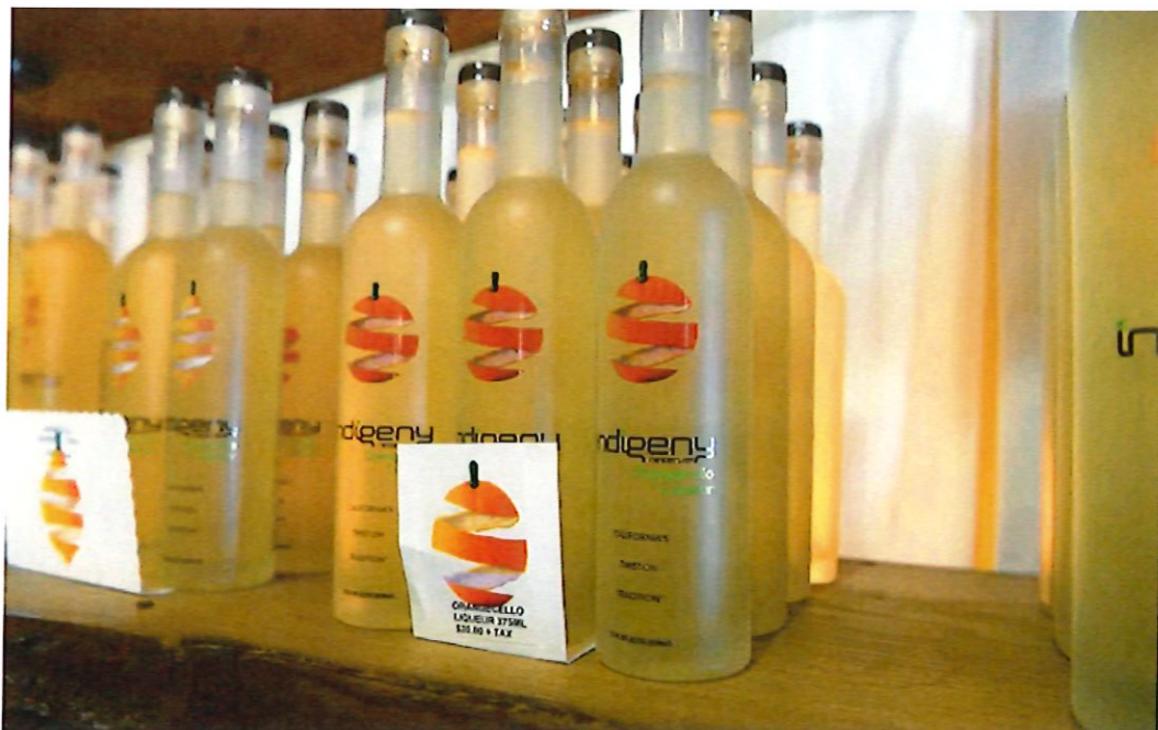
Brandies, liqueurs and hard cider are made at Indigeny Reserve, a cider distillery with acres of apple orchards, a tasting room and beautiful views just outside Sonora.

And in the rolling hills to the north, Indigeny Reserve is home to organic apple orchards, a cidery and a distillery that makes brandy and liqueurs. Taste your way through the cider lineup, which typically includes rotating seasonal sips as well as its extra-crisp apple and blackberry flagship ciders. When the place gets busy — during the spring or harvest festival or other family-friendly events — it can be the most exciting place in Sonora, with food trucks, shopping vendors, cotton candy carts, live music and more.