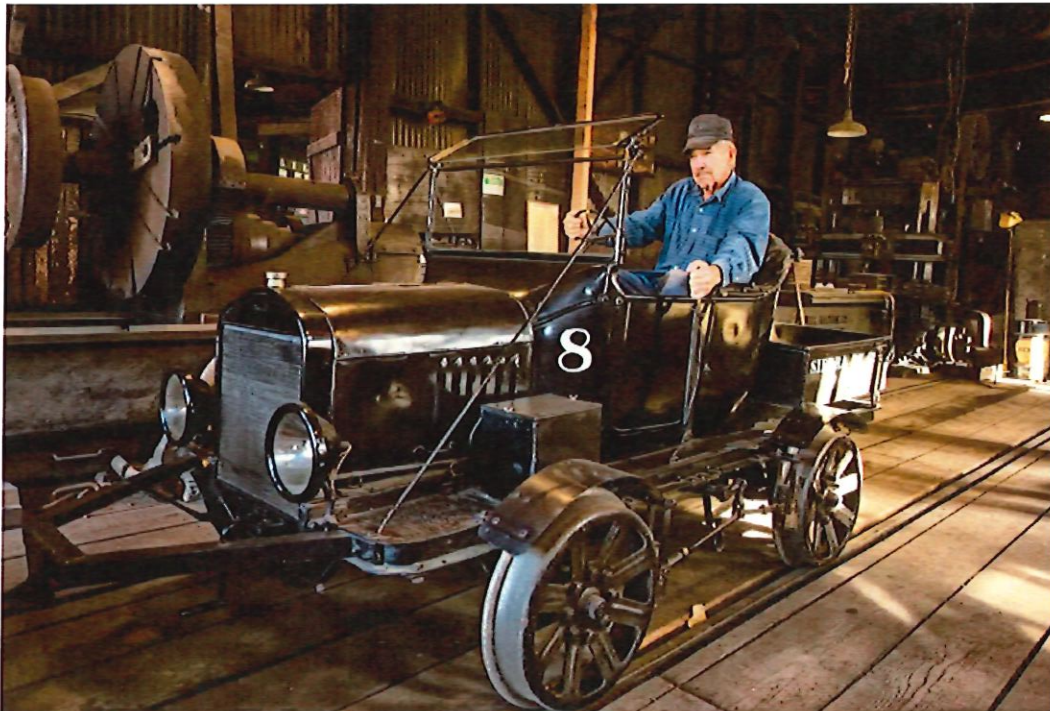
Jamestown 1897 State Historic Park captures the lore and history of the Gold Rush and the rise of the railroad in California's Sierra Foothills.

Train enthusiasts and history buffs alike will enjoy a visit to Railtown 1897 State Historic Park, a complex that offers tours of the original roundhouse and turntable, where steam-driven locomotives and train cars were repaired and maintained, and peeks at the blacksmith area and a 19th-century belt-driven machine shop.