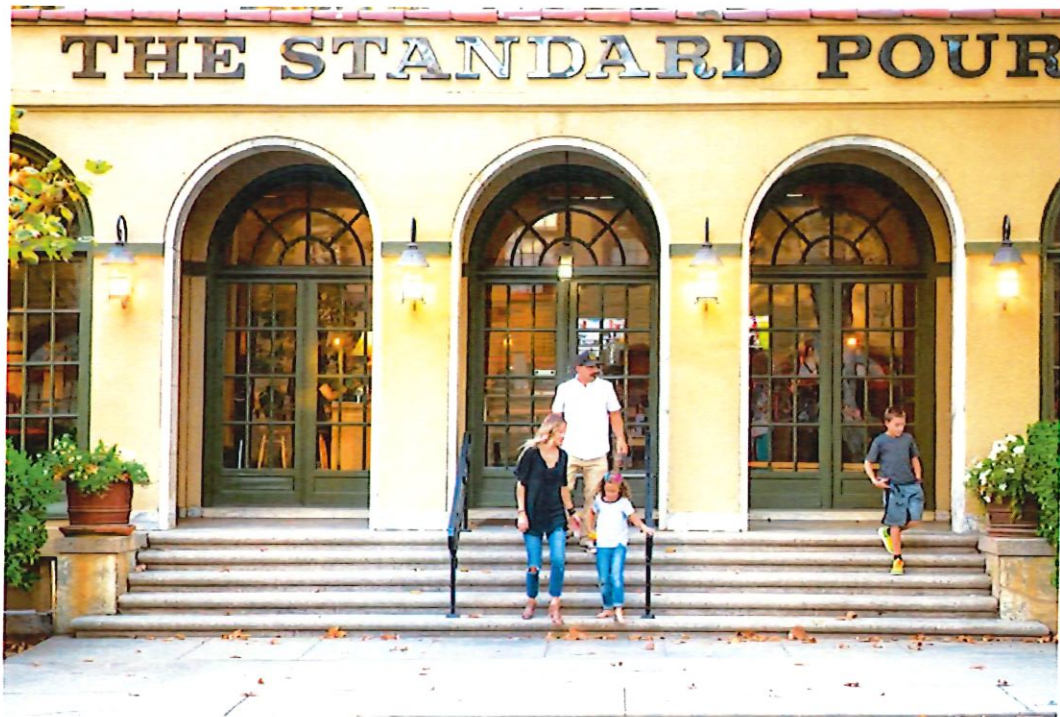
The building that houses Standard Pour, a casual restaurant in east Sonora, was once a lumber building office.

And in the rolling hills to the north, Indigeny Reserve is home to organic apple orchards, a cidery and a distillery that makes brandy and liqueurs. Taste your way through the cider lineup, which typically includes rotating seasonal sips as well as its extra-crisp apple and blackberry flagship ciders. When the place gets busy — during the spring or harvest festival or other family-friendly events — it can be the most exciting place in Sonora, with food trucks, shopping vendors, cotton candy carts, live music and more.