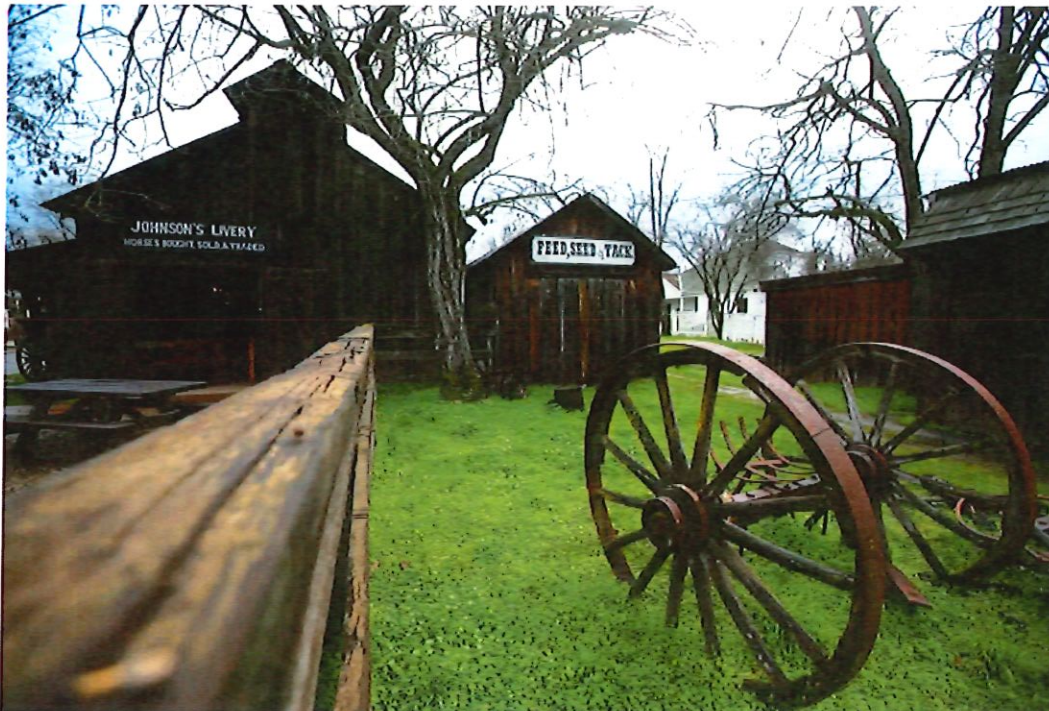
Some 30 buildings at Columbia State Historic Park date back to the Gold Rush. (Aric Crabb/Bay Area News Group) Aric Crabb/Bay Area News Group

The Columbia Mercantile 1855 sells everything from baked goods and nostalgic sweets to local wines, craft beer and sarsaparilla from its old-school, brick-walled grocery store. Parrott's Blacksmith offers monogrammed horseshoes, railway spikes and kitchen wares molded from wrought iron. There's even a candle dipping stand down one of the alleyways.