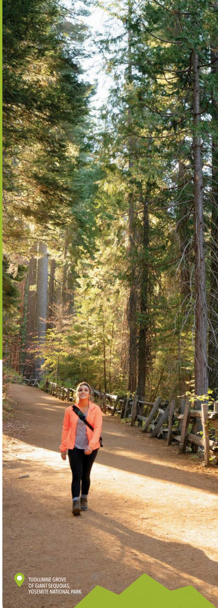
TUOLUMNE GROVE OF GIANT SEQUOIAS, YOSEMITE NATIONAL PARK