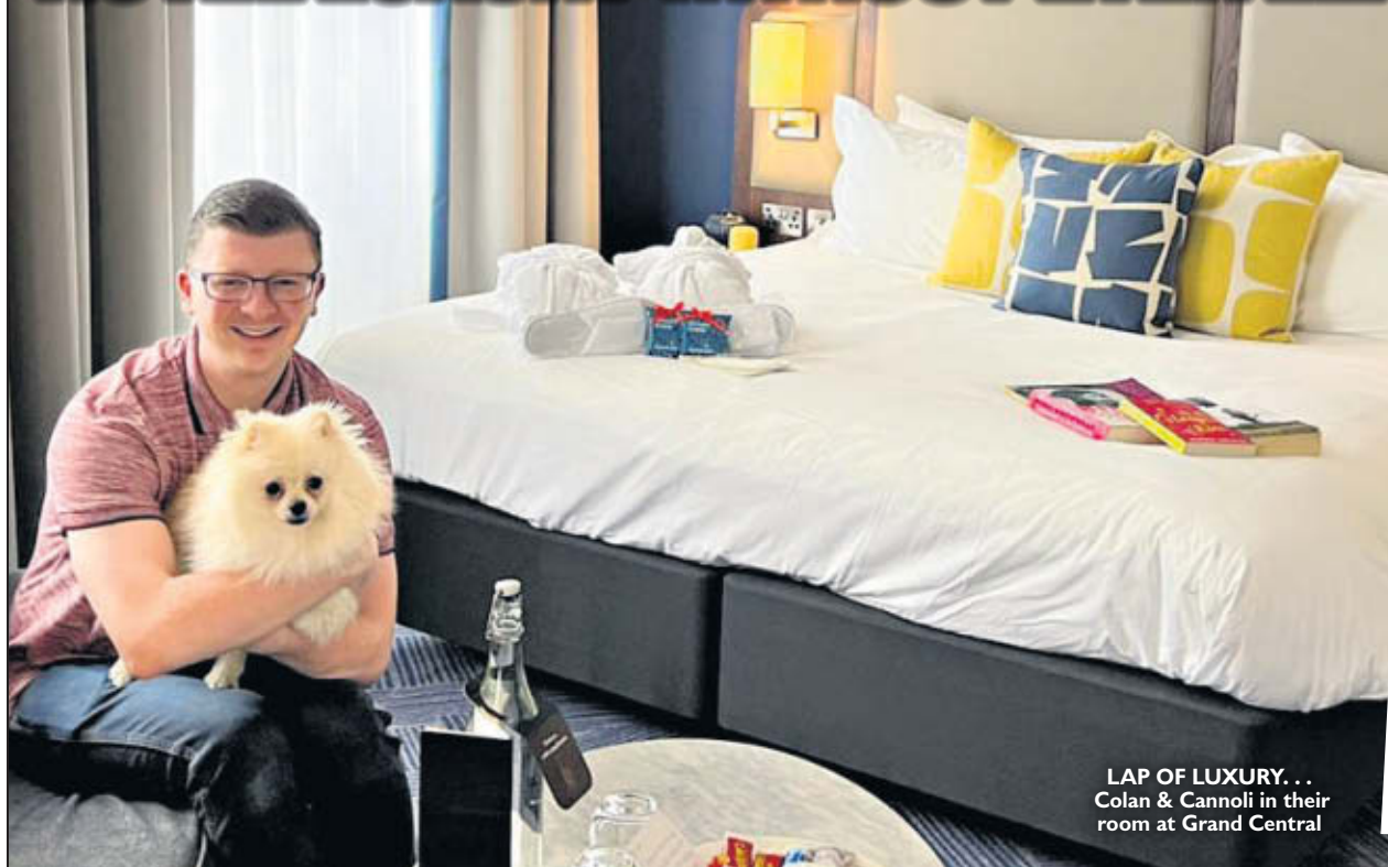
LAP OF LUXURY... Colan & Cannoli in their room at Grand Central